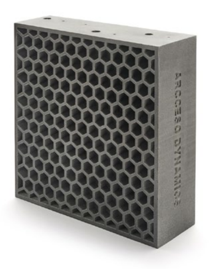
Figure 2: Reaction Injection Mold printed with HP Jet Fusion 3D 4200 and HP 3D HR PA 12 Data courtesy of Arcesso Dynamics.