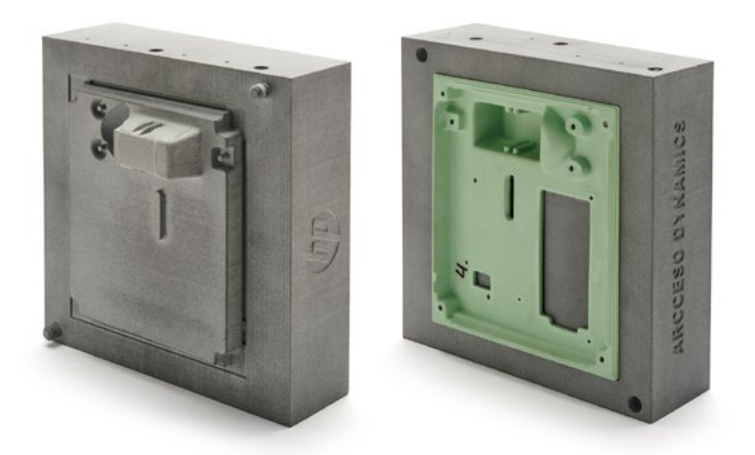
Figure 1: Reaction Injection Mold printed with HP Jet Fusion 3D 4200 and HP 3D HR PA 12

The process involves the injection of two compounds—polyol and isocyanate—that react with each other to form polyurethane. Polyurethane-curing chemical reactions that occur inside a RIM mold normally take place at low temperatures and pressures, comparable with the conditions of plastic Injection Molding. These low-pressure and -temperature working parameters make HP Multi Jet Fusion (MJF) materials very suitable for RIM mold manufacturing.