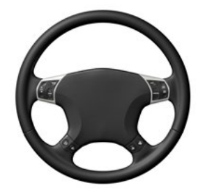
Figure 4: Medical device, a drink dispenser, and a steering wheel.