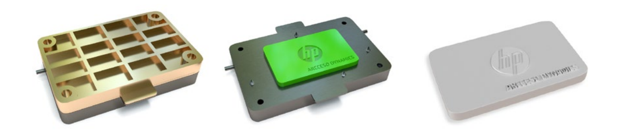
Figure 3: HP MJF-printed mold and part.